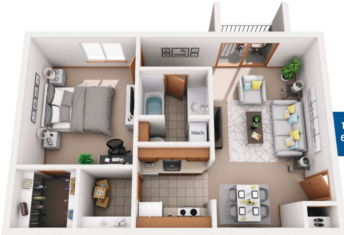
1 BEDROOM/1 BATH 640 SQ. FT.