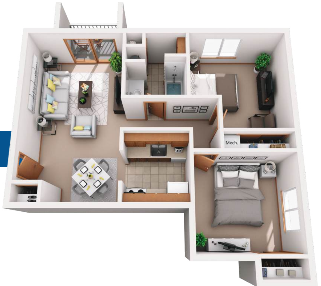
2 BEDROOM/1 BATH 700 SQ. FT.