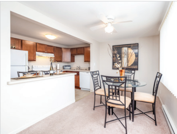
1 BEDROOM/1 BATH 633 SQ. FT.