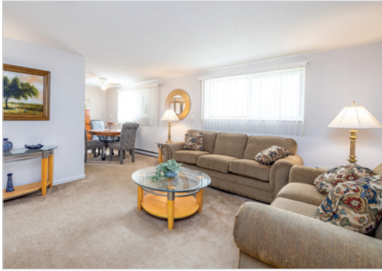
2 BEDROOM 1.5 BATH 890 SQ. FT.