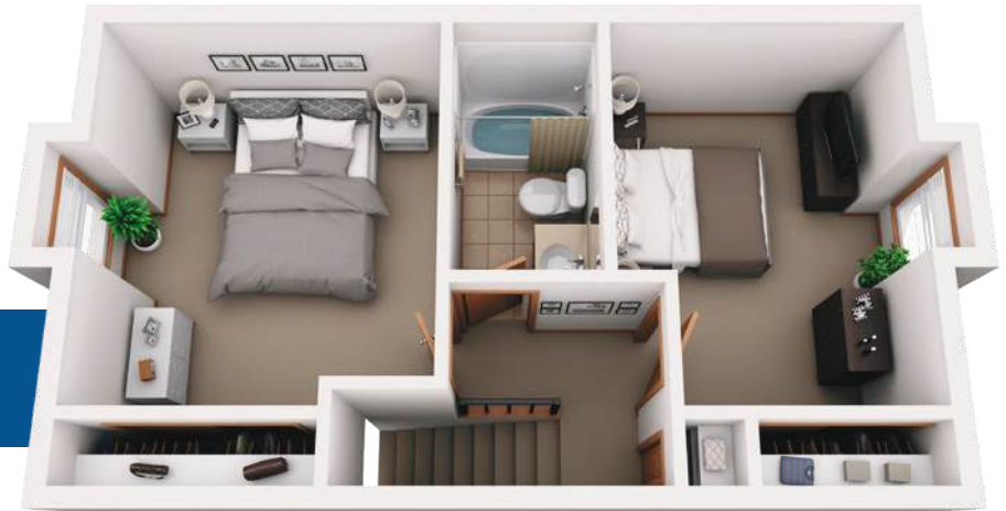
2 BEDROOM/1.5 BATH TOWNHOME 896 SQ. FT.