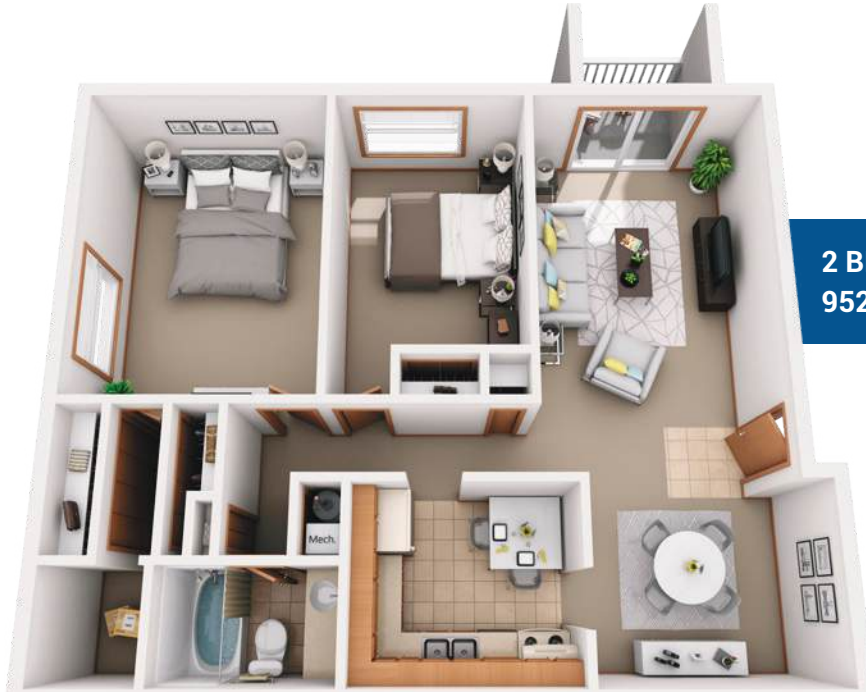
2 BEDROOM/1 BATH 952 SQ. FT.