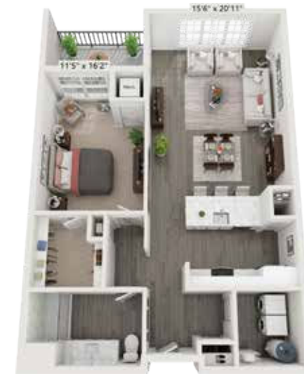
1 Bedroom 1 Bath 976 Sq. Ft.