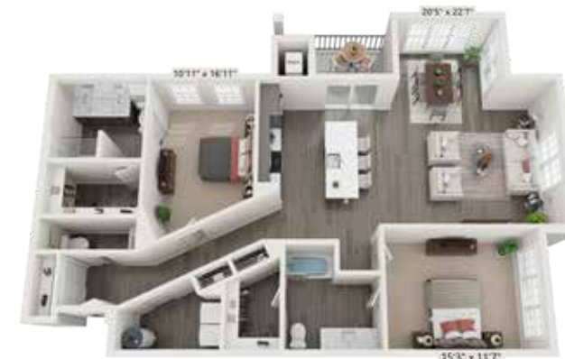
2 Bedroom 2 Bath 1420 Sq. Ft.