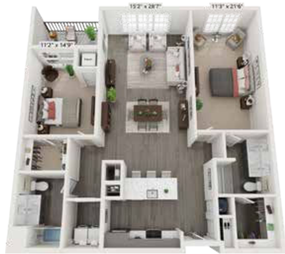
2 Bedroom 2 Bath 1404 Sq. Ft.