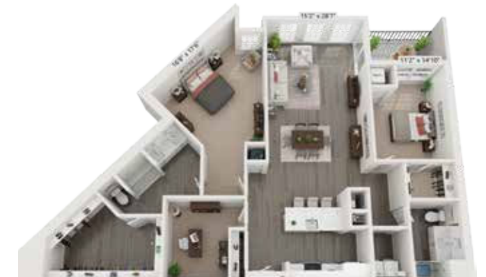
2 Bedroom 2 Bath + Den 1707 Sq. Ft.