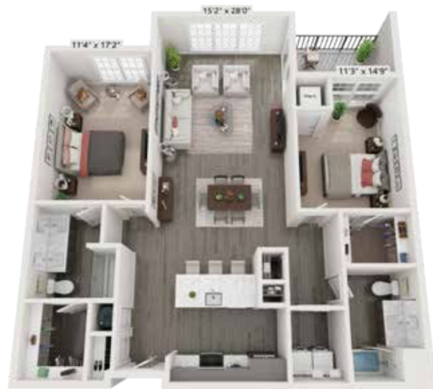
2 Bedroom 2 Bath 1360 Sq. Ft.