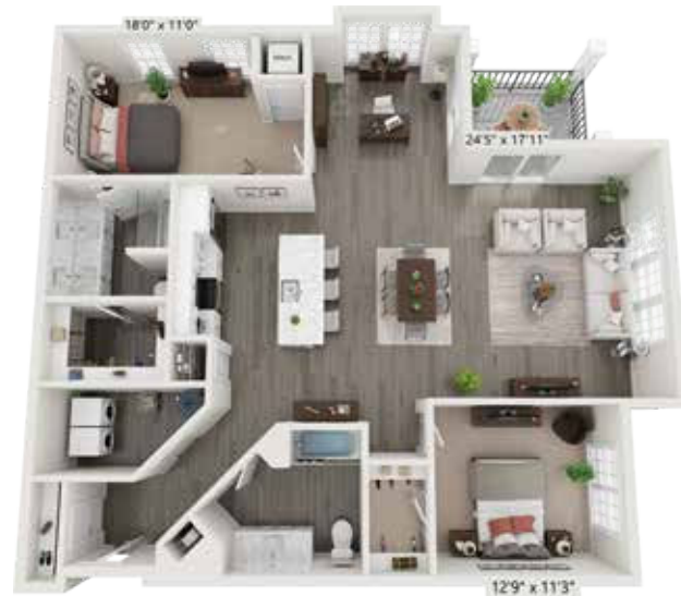
2 Bedroom 2 Bath + Flex Space 1520 Sq. Ft.