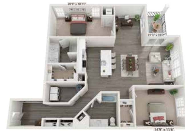
2 Bedroom 2 Bath + Flex Space 1534 Sq. Ft.