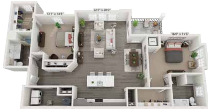
2 Bedroom 2 Bath 1502 Sq. Ft.