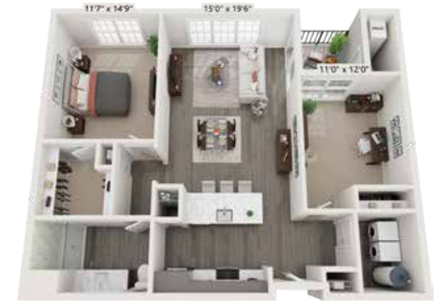
1 Bedroom 1 Bath + Den 1058 Sq. Ft.