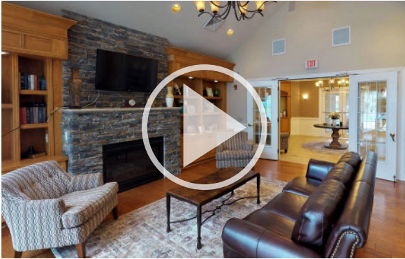
Click to see clubhouse virtual tour.

With onsite parking, available garages, and a smoke-free environment, everything is designed for easy living. Plus, you're just minutes from Fairport Village, the Erie Canal, local wineries, and major employers—right where you want to be.