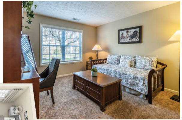
2 BEDROOM / 2 BATH WITH DEN APARTMENT* 1,319 - 1,369 SQ FT