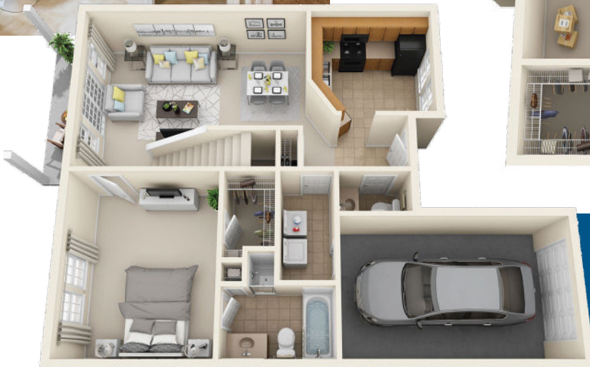
2 BEDROOM / 2.5 BATH WITH DEN TOWNHOME 1,400 SQ FT 1-CAR ATTACHED GARAGE

*Available as first floor or second floor options