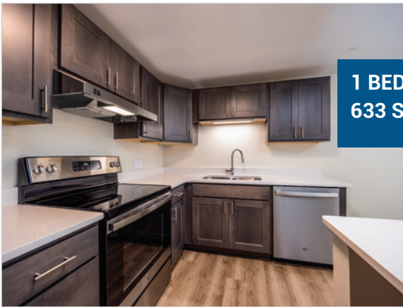
1 BEDROOM/1 BATH 633 SQ. FT.