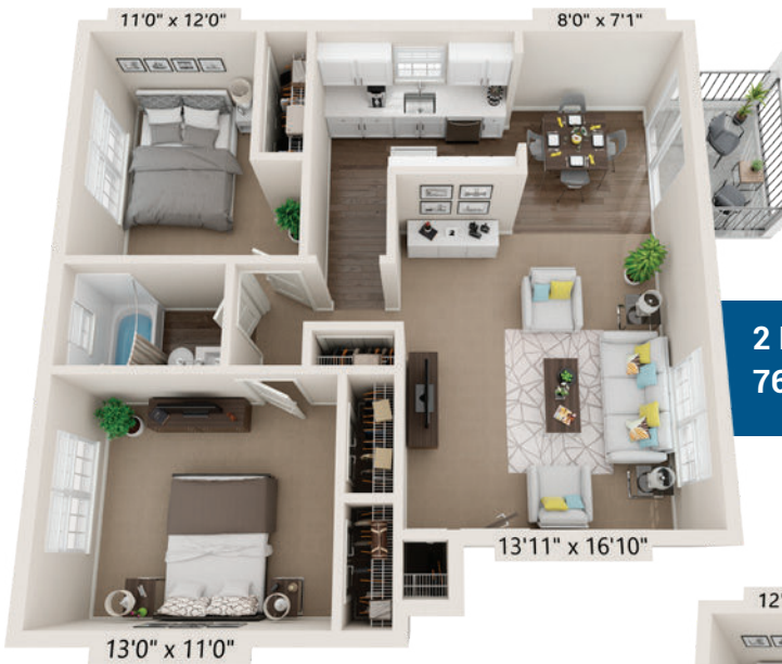
2 BEDROOM/1 BATH 766 SQ. FT.