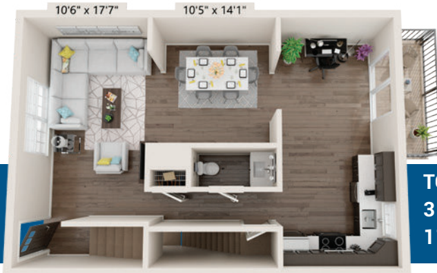
TOWNHOME 3 BEDROOM/1.5 BATH 1193 SQ. FT.