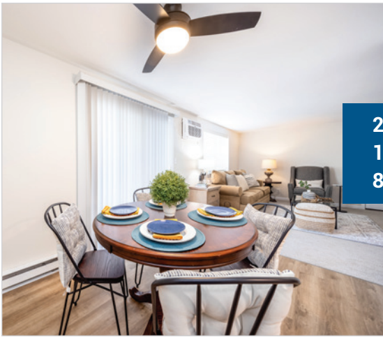
2 BEDROOM 1.5 BATH 890 SQ. FT.