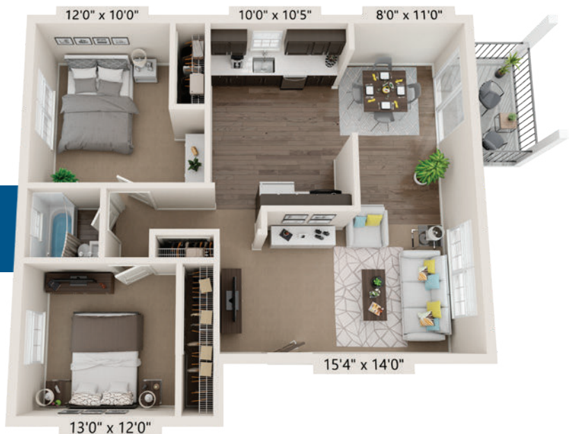
2 BEDROOM/1 BATH 779 SQ. FT.