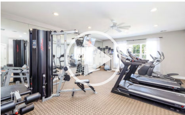
Click to see clubhouse virtual tour.

Experience luxury living with our exceptional amenities. Relax by our resort-style heated saltwater pool or gather with friends around the outdoor fire pit in our inviting seating area. Our 24/7 resident clubhouse features a spacious great room, business center, fitness center, and theater room. For students and professionals alike, select buildings offer a multi-purpose study lounge for a quiet and productive environment. Every feature is thoughtfully designed to elevate your living experience and meet your diverse needs.