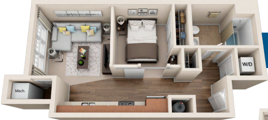
STUDIO 557 SQ. FT.