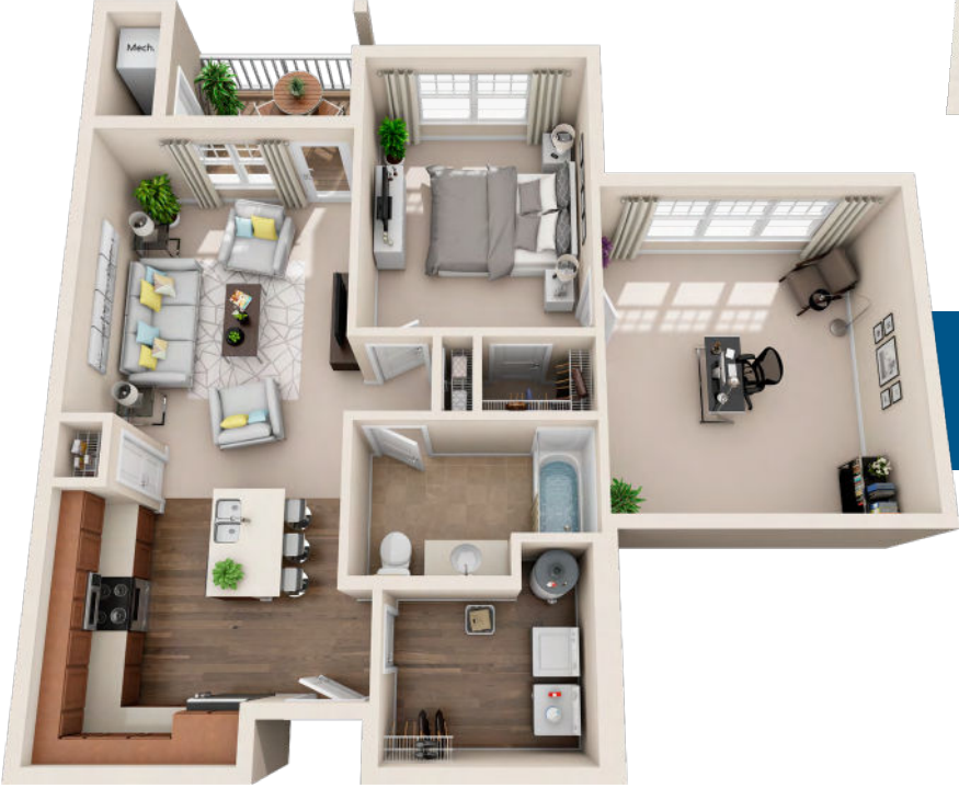
1 BEDROOM/1 BATH WITH DEN 1041 SQ. FT.