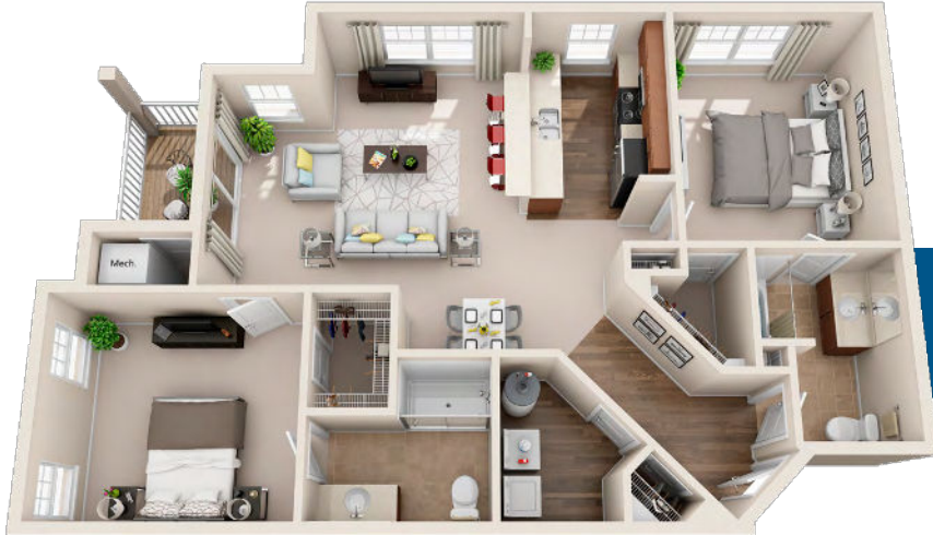
2 BEDROOM/2 BATH DUAL MASTER 1270 SQ. FT.