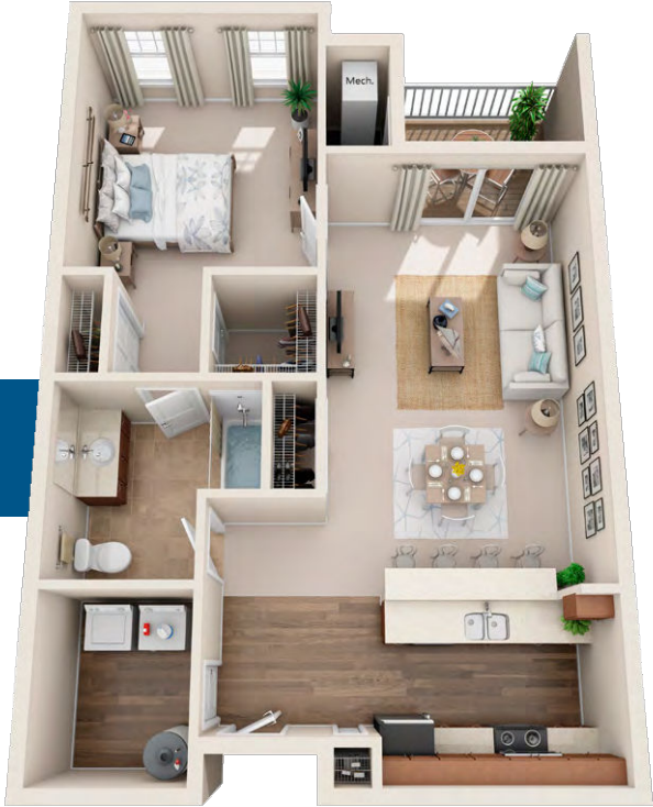
1 BEDROOM/1 BATH 898 SQ. FT.