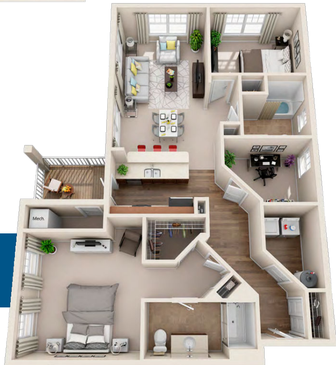
2 BEDROOM/2 BATH WITH DEN 1327 SQ. FT.