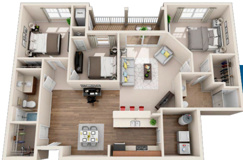
3 BEDROOM/2 BATH 1416 SQ. FT.