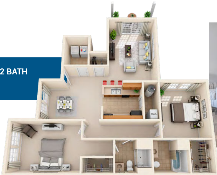
2 BEDROOM, 2 BATH 1188 SQ. FT.