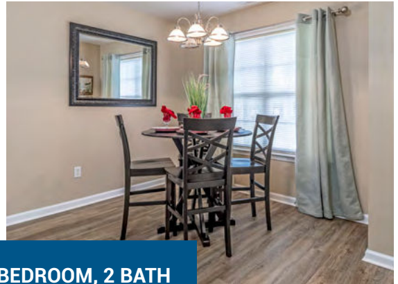
3 BEDROOM, 2 BATH 1332 SQ. FT.