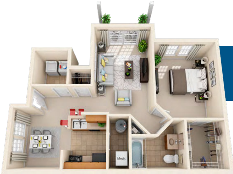
1 BEDROOM, 1 BATH FIRST FLOOR 865 SQ. FT.