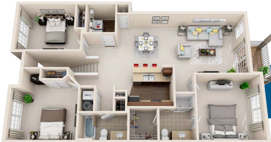
3 BEDROOM, 2 BATH ATTACHED GARAGE 1497 SQ. FT.