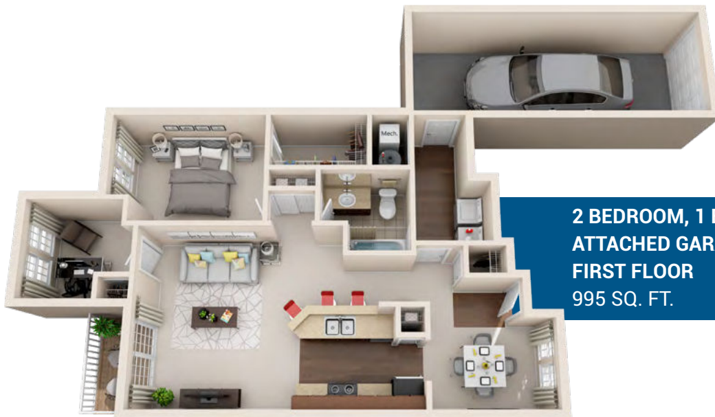
2 BEDROOM, 1 BATH ATTACHED GARAGE FIRST FLOOR 995 SQ. FT.