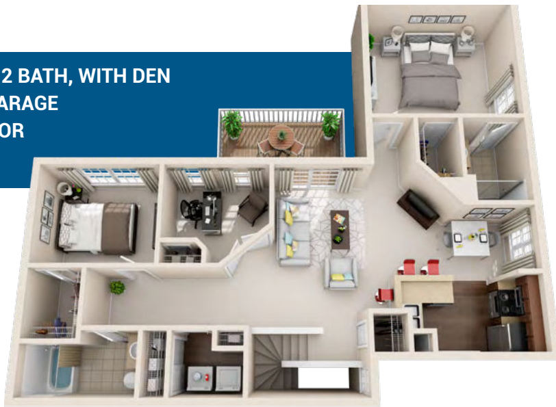
2 BEDROOM, 2 BATH, WITH DEN ATTACHED GARAGE SECOND FLOOR 1346 SQ. FT.