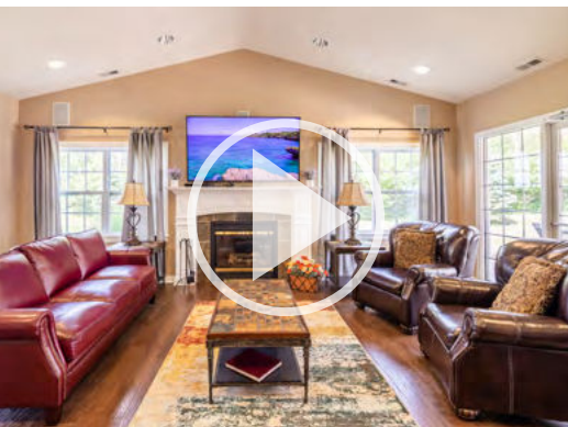
Click to see Clubhouse virtual tour.

Plus, we are located on Hammocks Drive, which puts you near a host of shopping, dining, and entertainment, including Crossroads Center and Woodlawn Beach State Park.