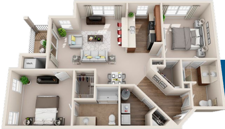
2 BEDROOM/2 BATH DUAL MASTER 1270 SQ. FT.