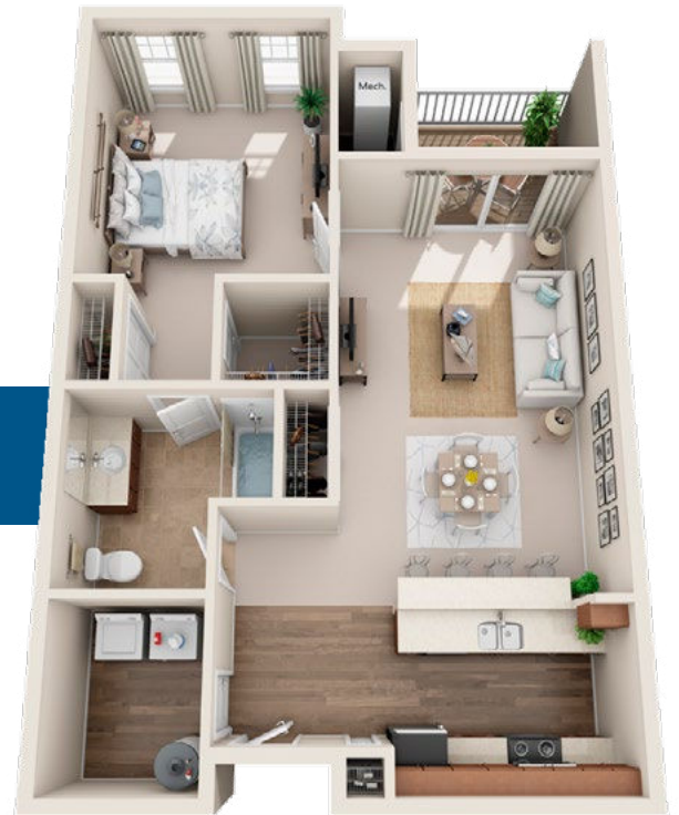
1 BEDROOM/1 BATH 898 SQ. FT.