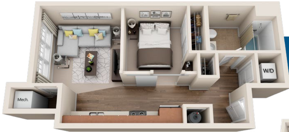
STUDIO 557 SQ. FT.