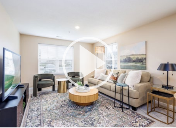
Click to see apartment virtual tour.